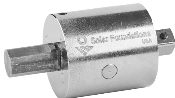
120 in-lbs Inline Preset Torque Limiter

Prices and product availability are subject to change without notice.