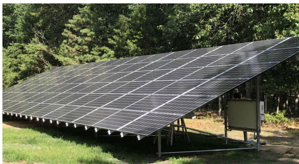
Equipment Support Column (ESC)