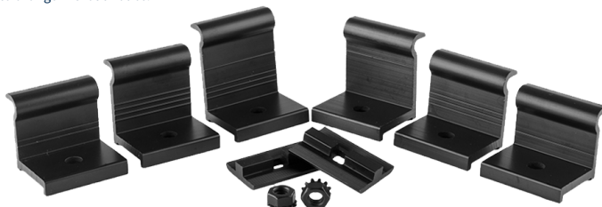
Black Panel Hardware

Prices and product availability are subject to change without notice.